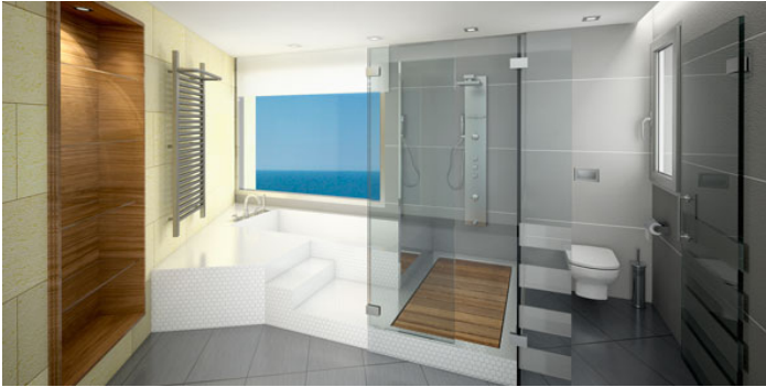
Main bathroom luxury Villa Cala Moraig