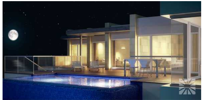
Luxury Villa Cala Moraig by night