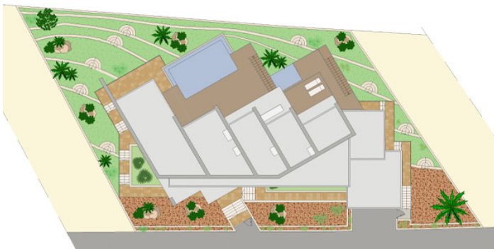
Plot layout plan luxury Villa Cala Moraig