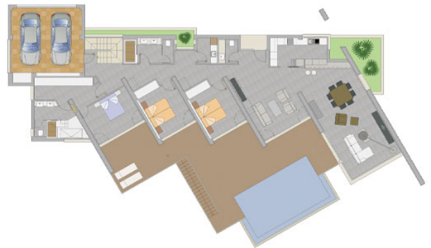
Layout plan top floor luxury Villa Cala Moraig