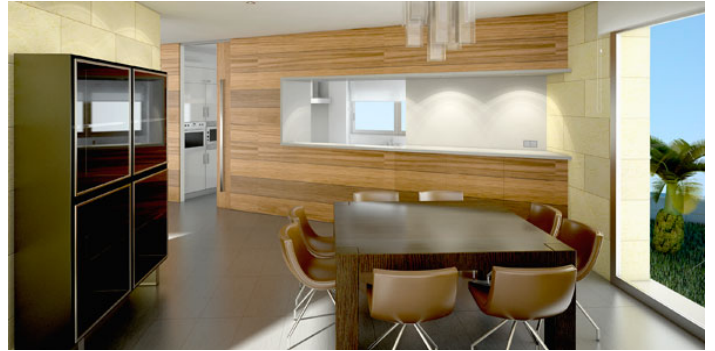
Kitchen luxury Villa Cala Moraig