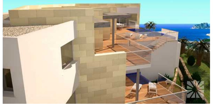
Views to the Mediterranean Sea from luxury Villa Cala Moraig