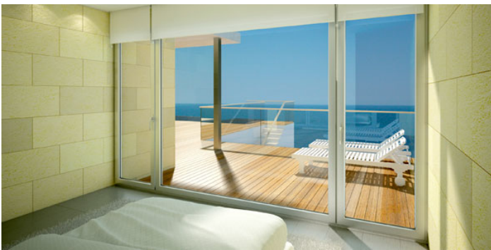
Main bedroom luxury Villa Cala Moraig