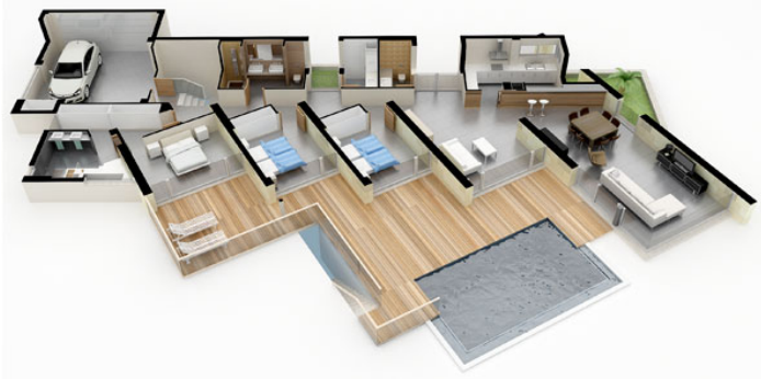
Axonometric plan top floor luxury Villa Cala Moraig