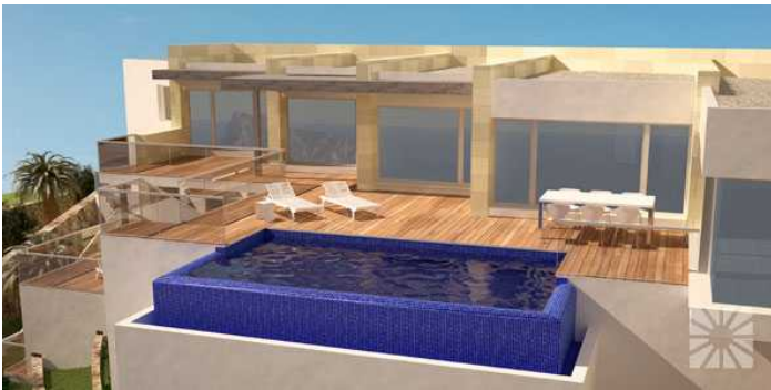
Pool area luxury Villa Cala Moraig