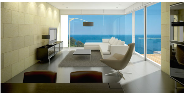
Living room luxury Villa Cala Moraig