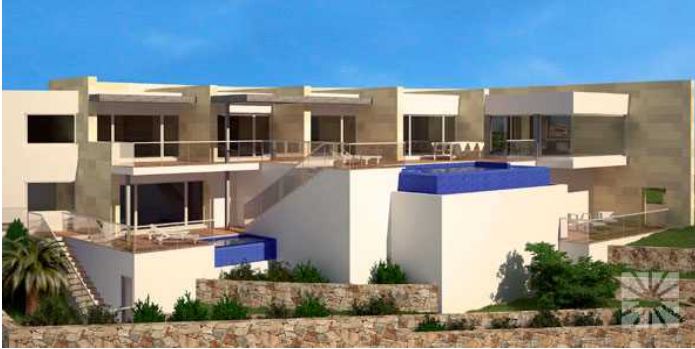
Frontal view luxury Villa Cala Moraig