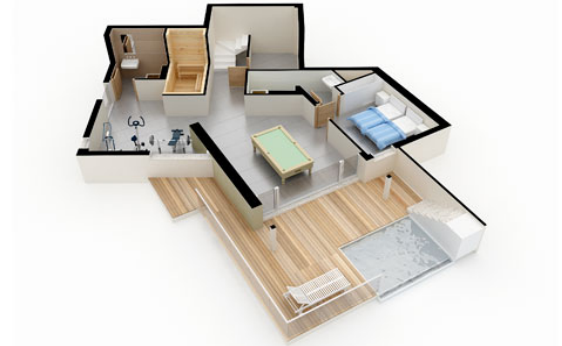
Axonometric plan ground floor luxury Villa Cala Moraig