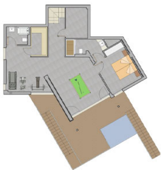
Layout plan ground floor luxury Villa Cala Moraig